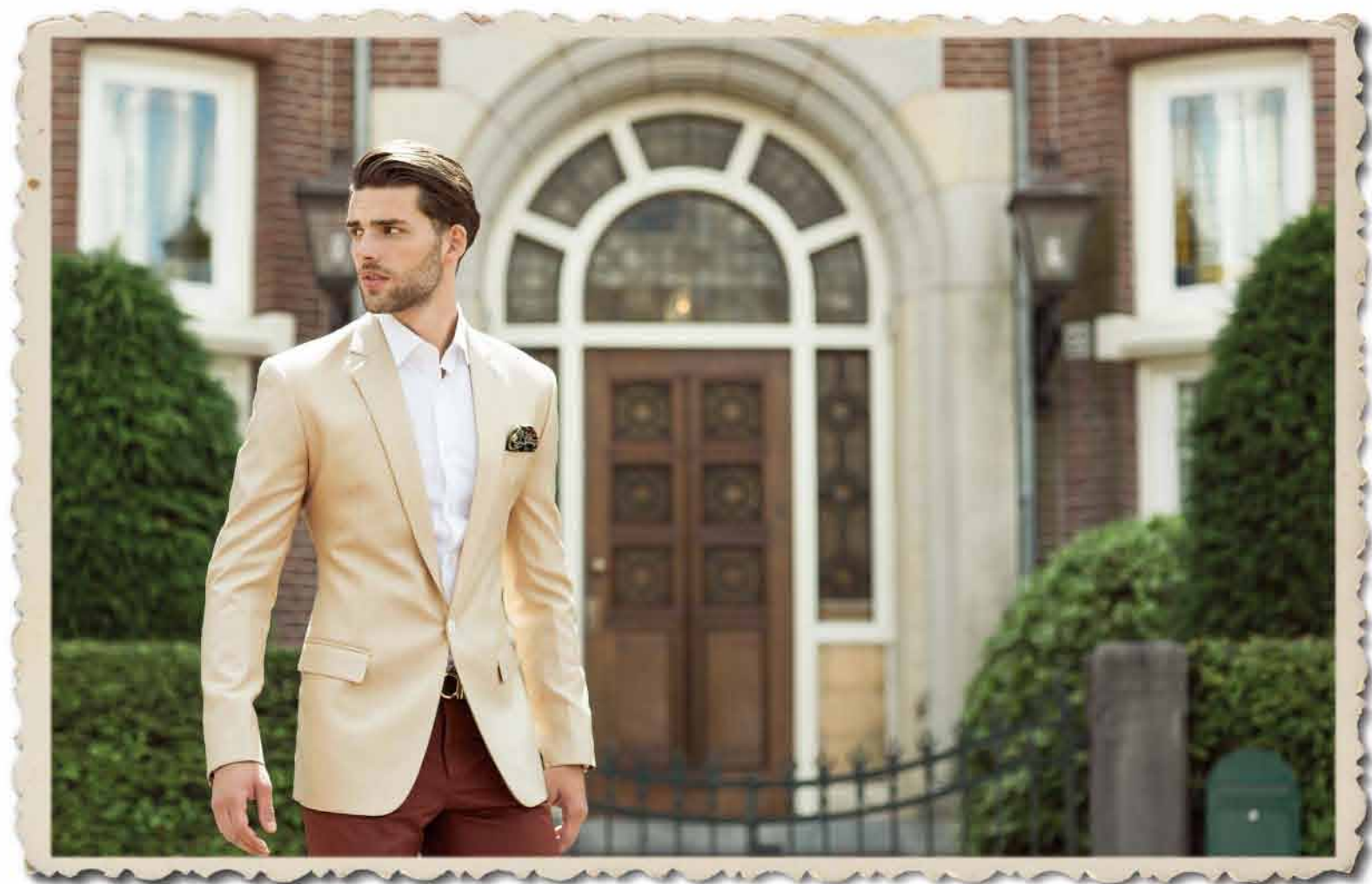
A masterpiece created by combining a soft cream button jacket with bold brick trousers. jacket - mulberry silk, c001883 / 302; trouser - the caviar, super 150's, c001302 / 302; shirt - vancouver, s000697 / 001