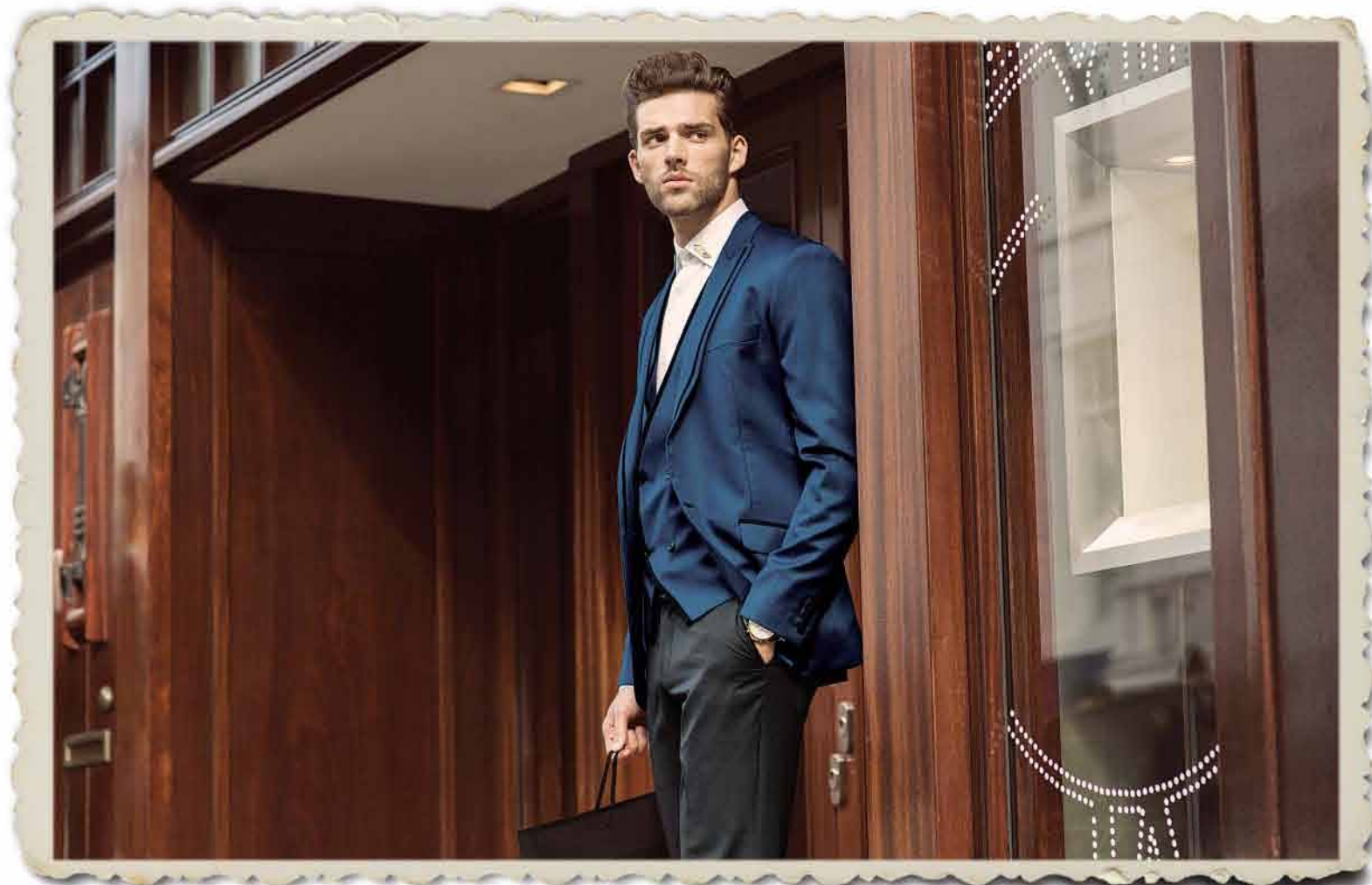
blue jacket and waistcoat with dark piping and black trousers worn with a white shirt, embellished with golden wing pins at the collar... truly ceremonial. jacket & waistcoat - maestro, super 100's, 4700032 / 057; trousers - urbane collection, super 120's, c001381 / 201; shirt - vancouver, s000697 / 001