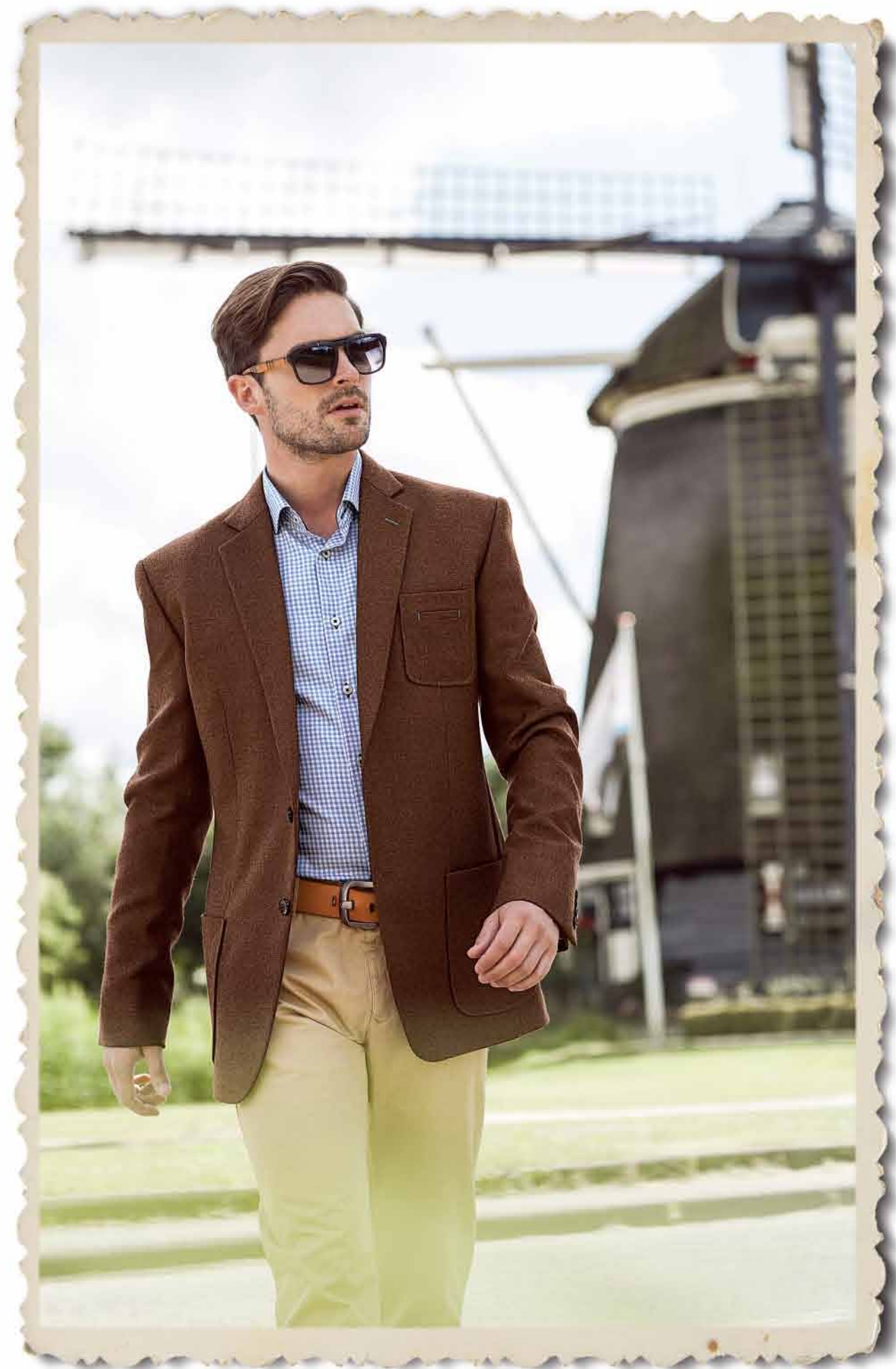
You can never go wrong with this classic combination of a brown woollen blazer worn with camel pants and sky-blue checked shirt. jacket - royal jacketing, c001326 / 503; shirt - vancouver, s000697 / 003