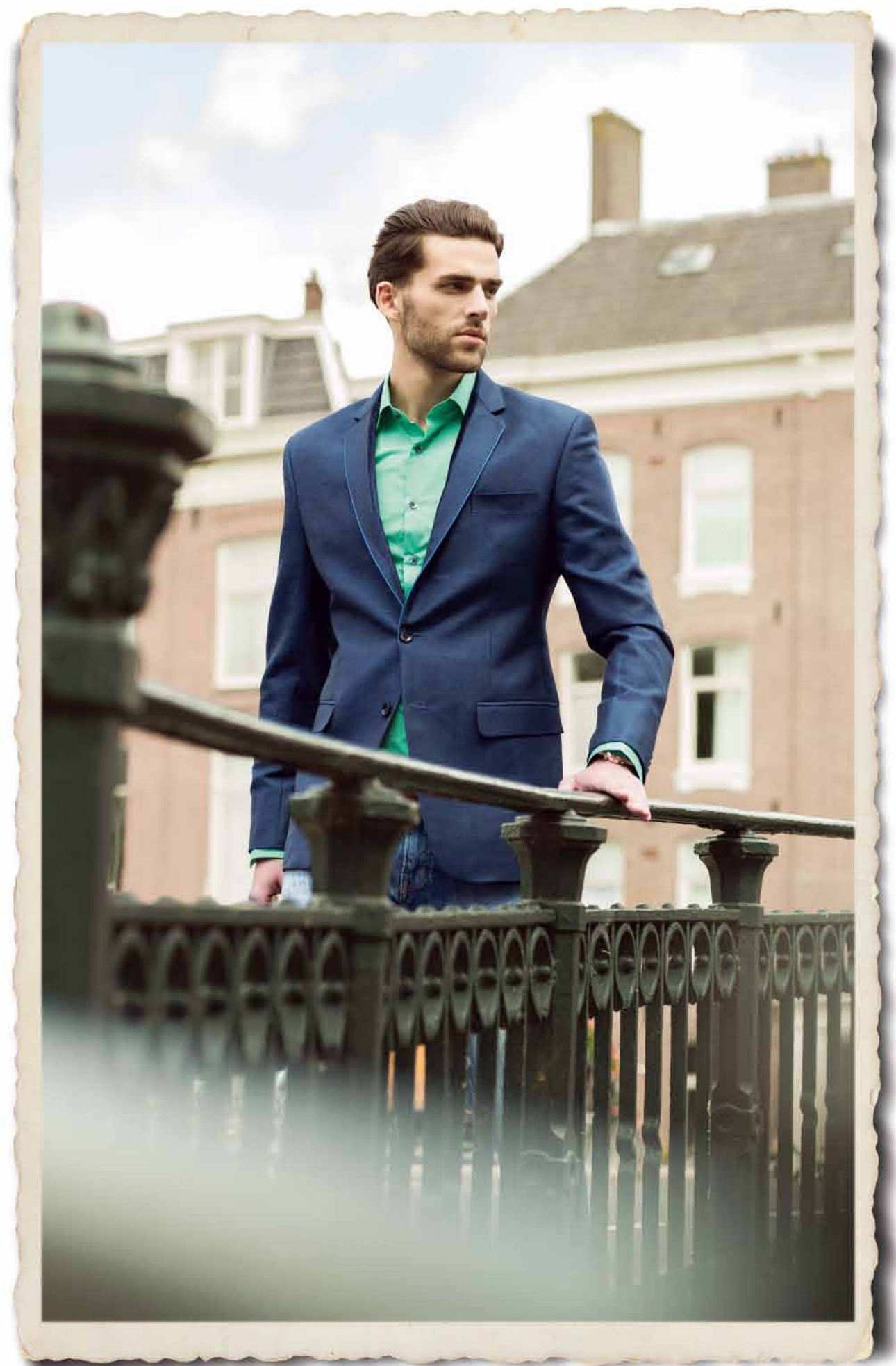
Royal blue, blended linen jacket is enriched with velvet and sky blue fabrics at the lapel and is worn with a green shirt and denims. jacket - linea supreme, c001982 / 201; shirt - aida, s000794 / 003