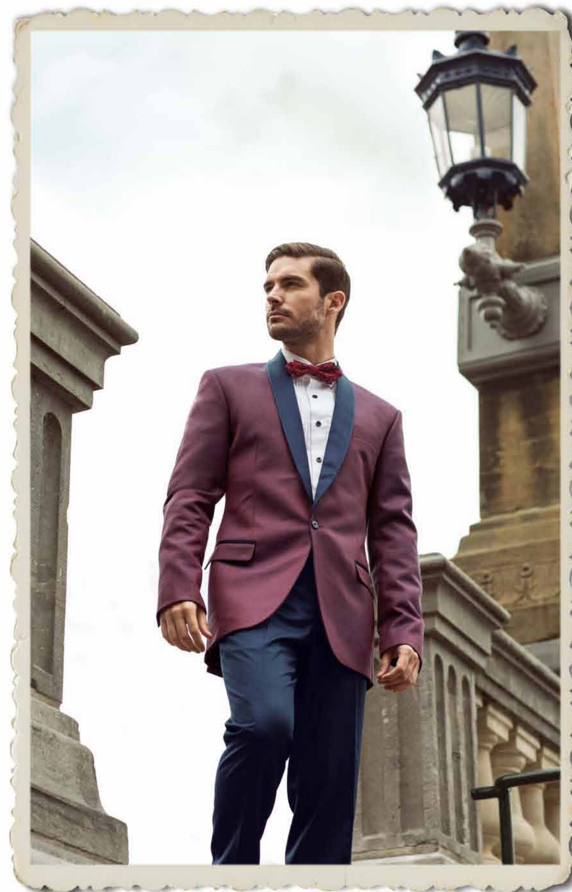
Ceremonial dobby jacket with navy satin shawl lapel and navy trousers and a contrasting bow tie. jacket - gold crest, c002089 / 202; trousers - maestro, super 100's, 4700032 / 057; shirt - madrid, s000820 / 001