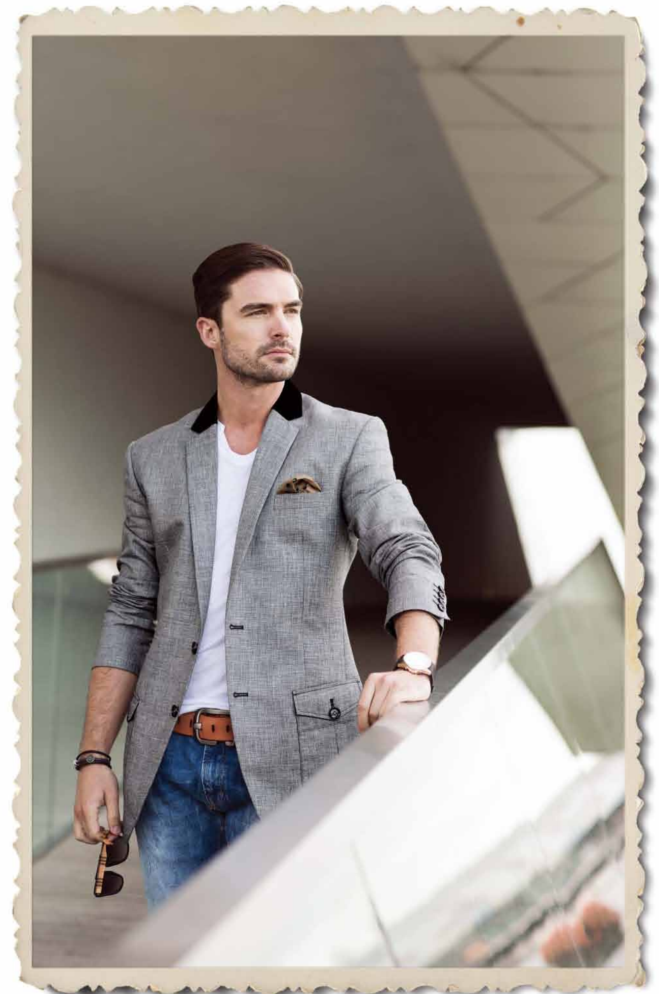
A masterclass in style: cotton linen with a dash of velvet at the collar teamed with denims. jacket - elite naturals, c002079 / 201