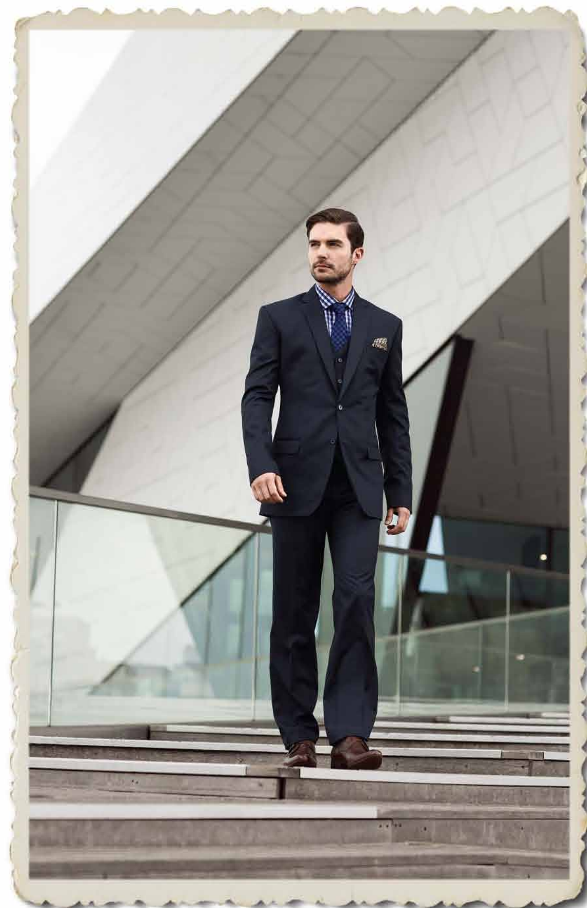
Classic navy 3-piece suit is teamed with blue checked shirt and striped tie.

jacket - ambiente, c002062 / 301; shirt - vancouver, s000697 / 003