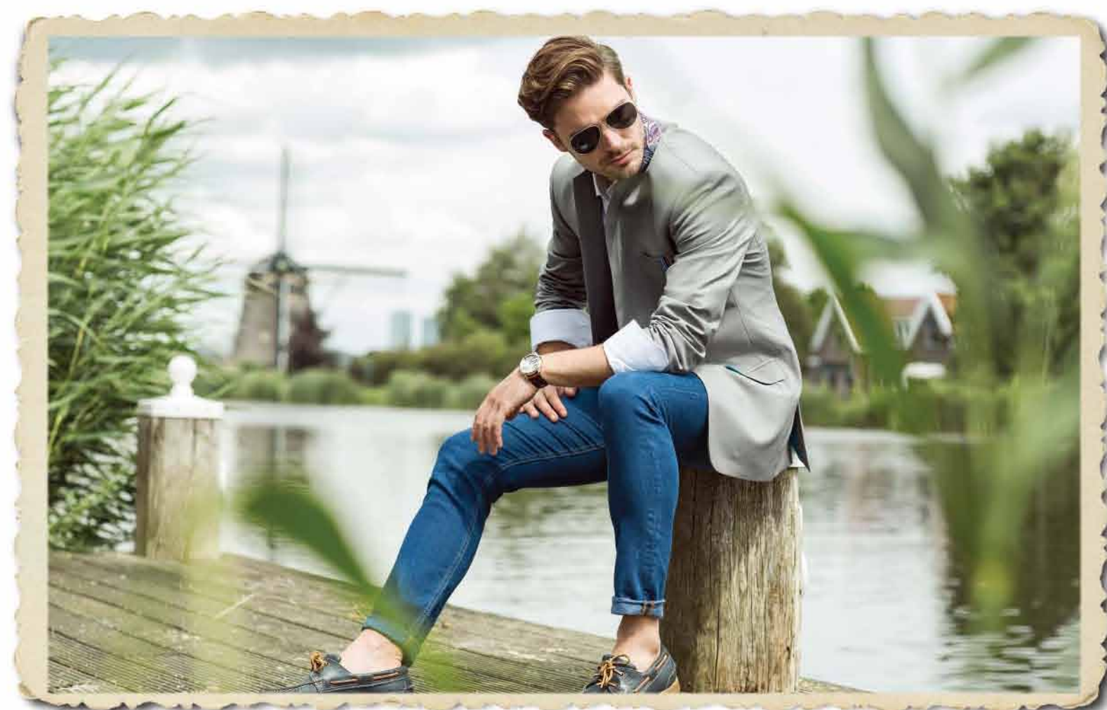
A convertible formal grey jacket with standing collar showing print inside and tape detailing at the pocket; teamed with denims and a white shirt. jacket - the caviar, 150's stretch, c000794 / 501; shirt - vancouver, s000697 / 001