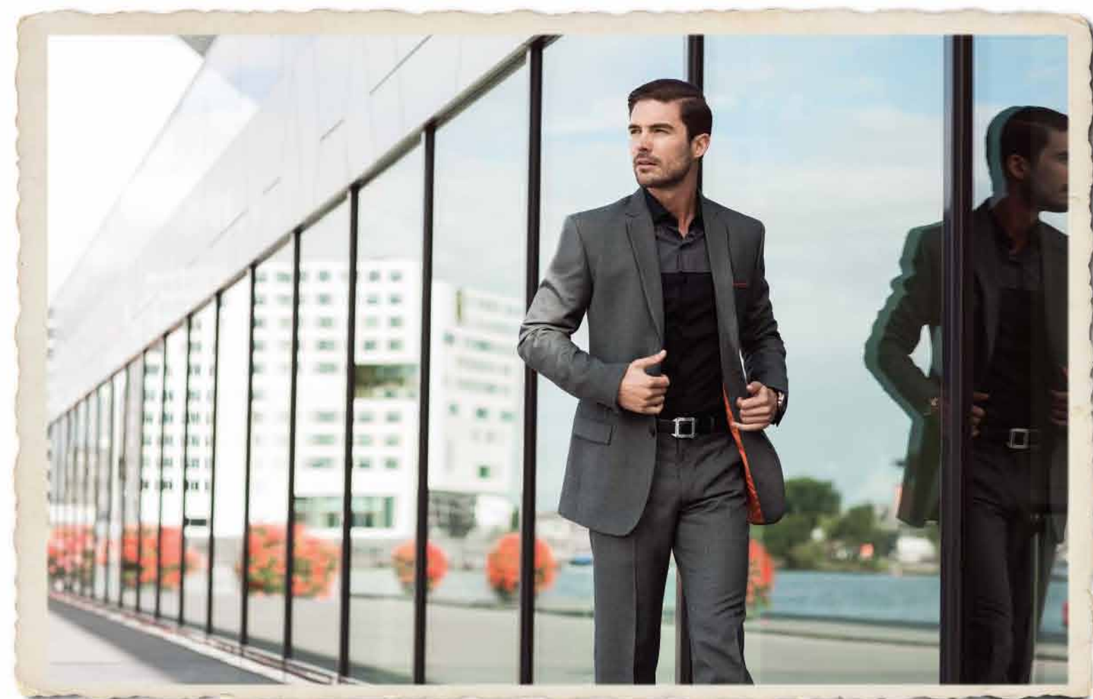
Impeccable ash grey suit is enlivened with smart zipper detailing at the lapels and valet pocket and is worn with colour blocked black shirt. suit - crystal, super 100's, c000540 / 501; shirt - viviana, s000673 / 001, contrast grey: vancouver, s000698 / 001