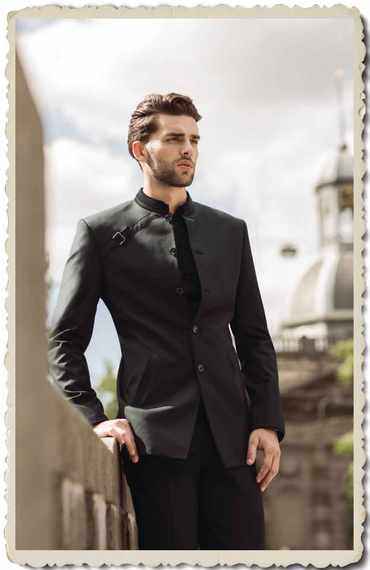
Stark and smart bandhgala in black with velvet at the collar worn with shirt and trousers. suit - the caviar, super 150's, c001302 / 101; shirt - viviana, s000673 / 001