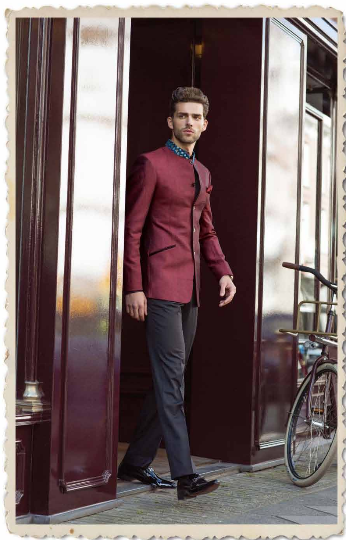
Worn with black trousers, this classic Indian wine-coloured bandhgala is elevated with intricate hand woven Jamevar silk collar and Italian cherry at the front with poker bones. bandhgala - linea supreme, c002106 / 510; trousers - the caviar, super 150's, c001302 / 101