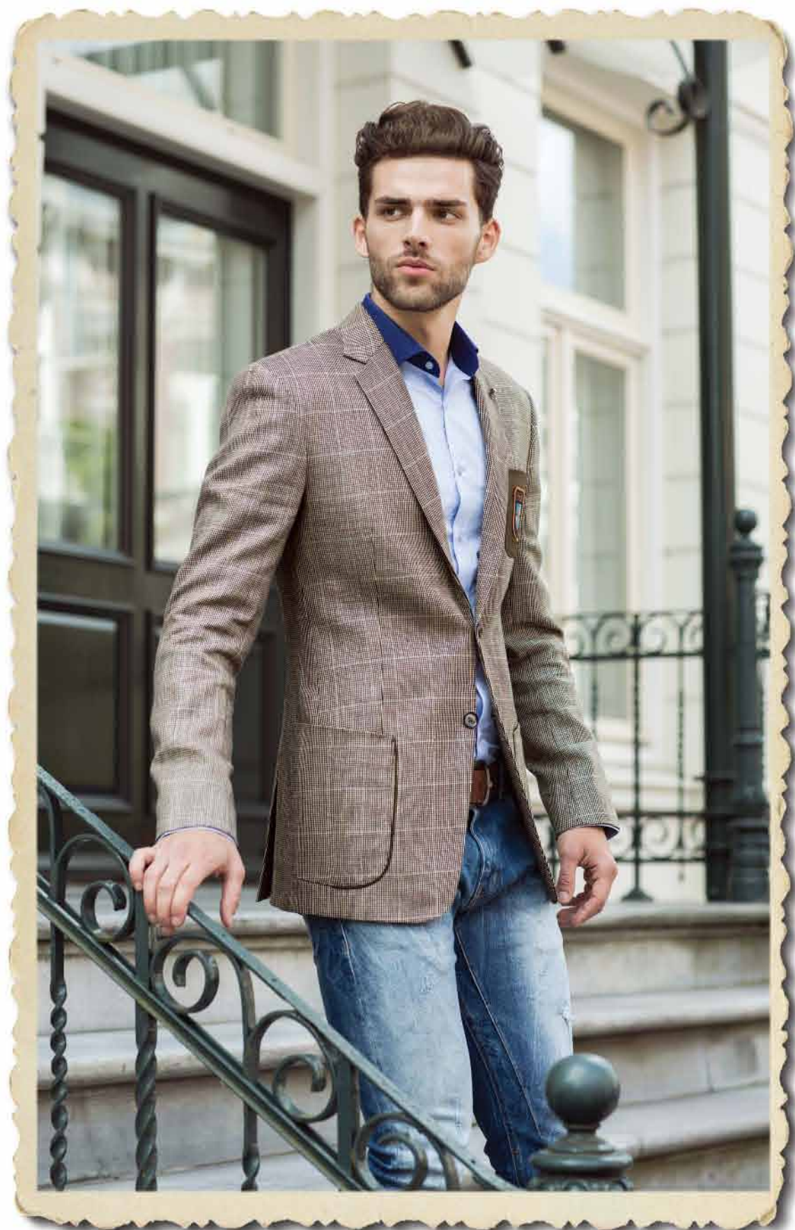
Greenish beige tweed jacket in vintage look with styled contrast pocket and badge; worn with navy collar sky blue shirt and denims.

jacket - ambiente, c002062 / 301; shirt - vancouver, s000697 / 003